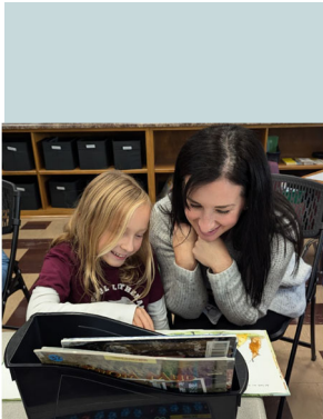
Muffins with Moms Day (above)

November brings a season of transition for our athletics program as we move from volleyball and soccer to basketball and cheer. We're excited to offer both girls' and boys' basketball teams and are still looking for a few assistant coaches to join us. This year, we're fortunate to have a full coaching staff, with teams competing at every level. If you're available, we'd love for you to join us at a home game—the first is on November 18. You can find all game dates and times on our school calendar here .