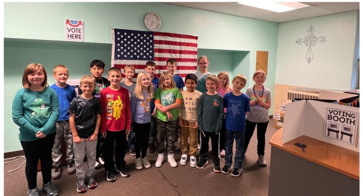
Goodies with Grandparents and 3rd Graders ready to cast their votes on Election Day